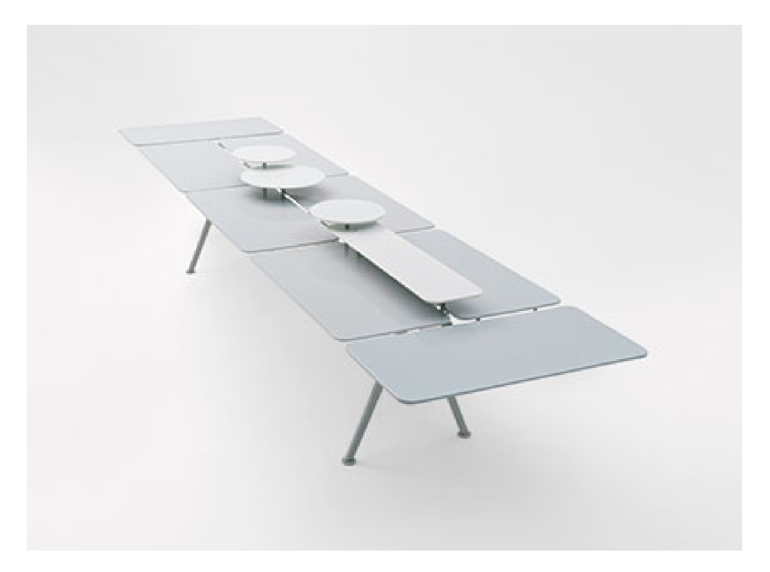
Table with aluminium base, tops and accessories in stoneware.

Base: gloss varnished legs and joints in cast aluminium, gloss varnished central plank under the top in extruded aluminium (reference colours: Mano Lucida wood sample collection). Adjustable aluminium feet.