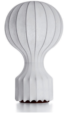
○ FU260109 White