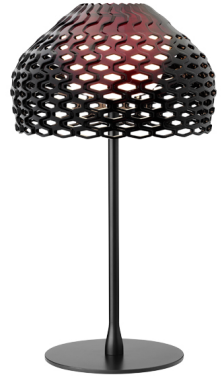
● FU776130 Black