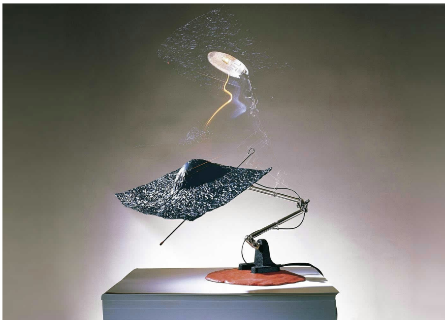
Don Quixote INGO MAURER UND TEAM 1989

Steel, aluminium, flexible plastic. Don Quixote bends, twists, turns and swivels.