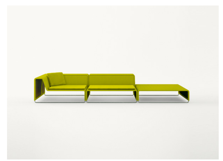
B11S + B11C + B11PB