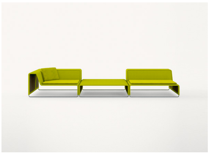
B11S + B11PB + B11C