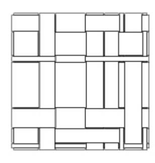
cm 300X300 116"x116"