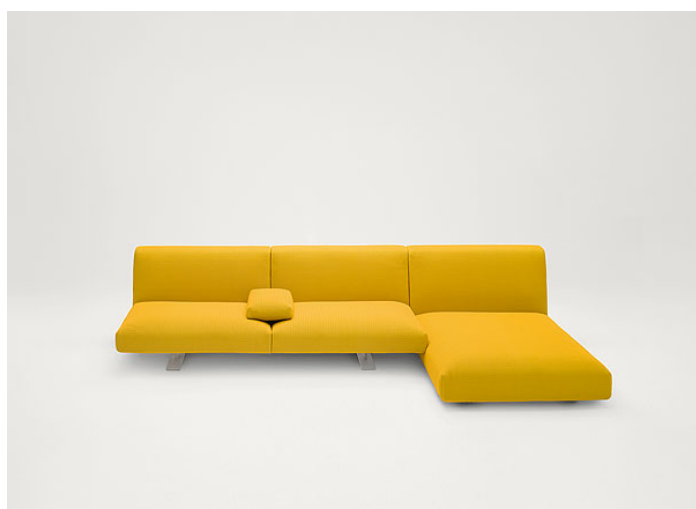
B93CB + B93S + B93V