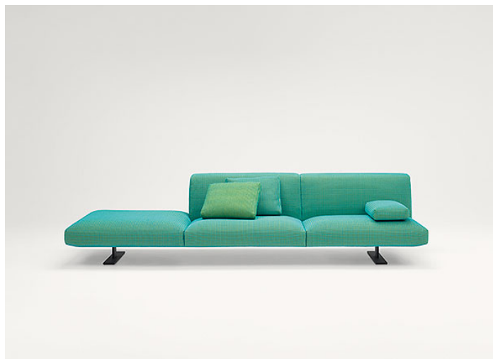
B93HB + B93S