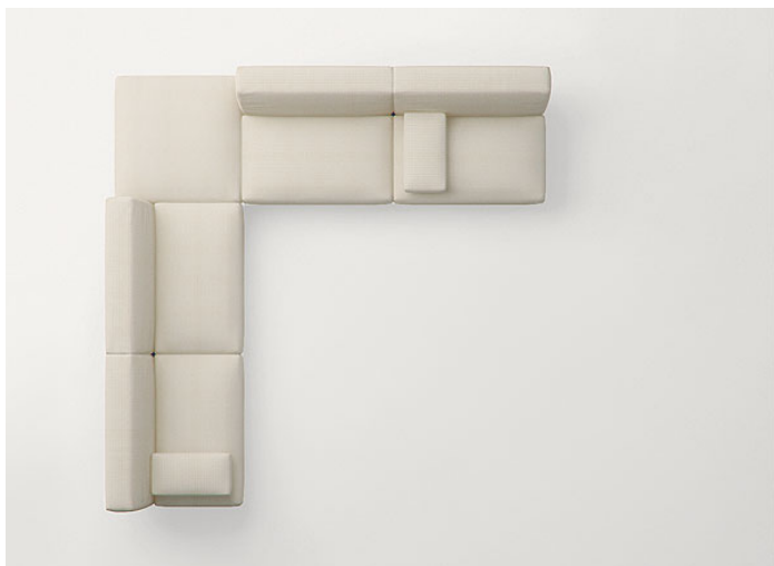
B93TB + B93DB + n°2 B93S