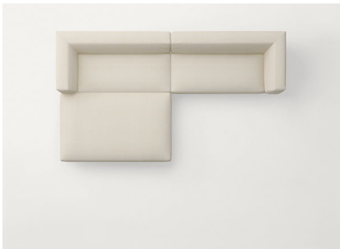
B93XSB + B93XDB + B93M