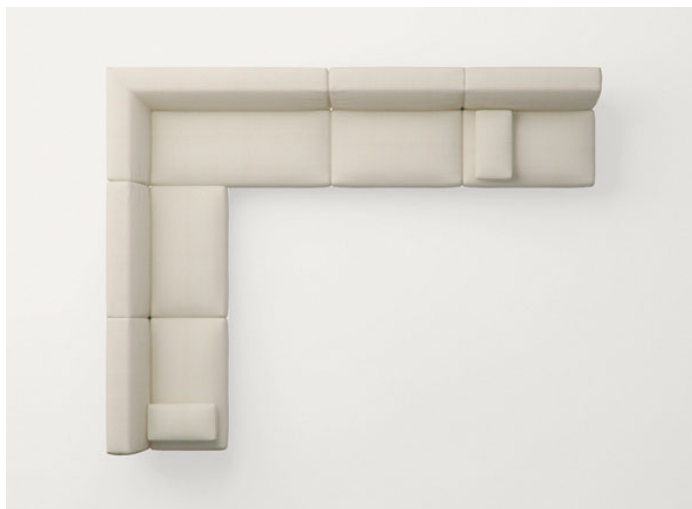
n°2 B93DB + B93XSB + n°2 B93S