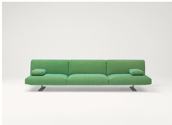
B93FB + n°2 B93S