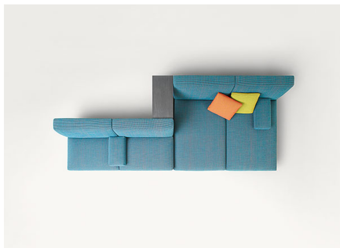
B93DB + B93Z + n°2 B93S