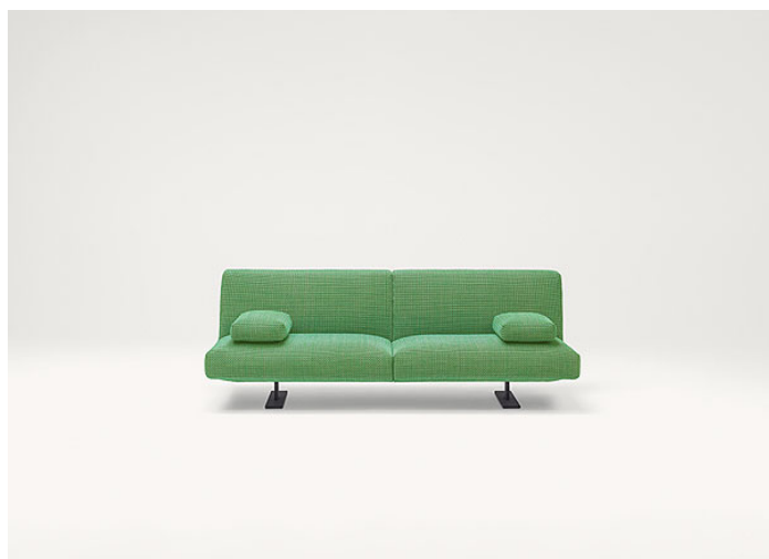
B93DB + n°2 B93S