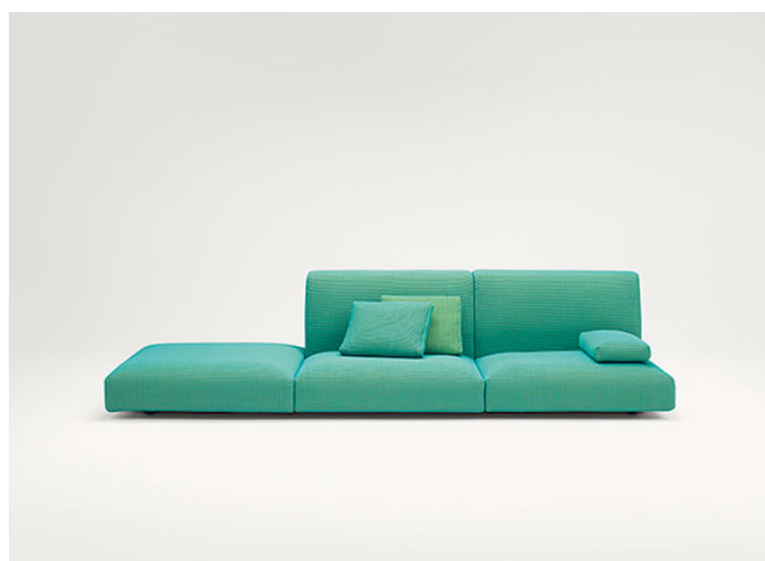
B93HA + B93S