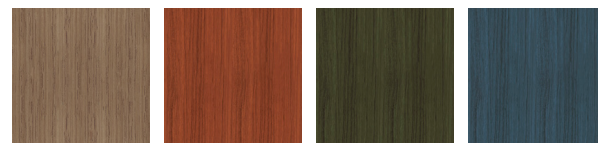
Iroko Natural Iroko Orange Iroko Green Iroko Blue