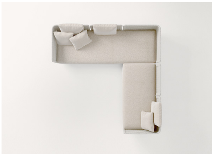
B39B + B39CD