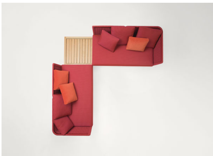
B39CS + B39PTD