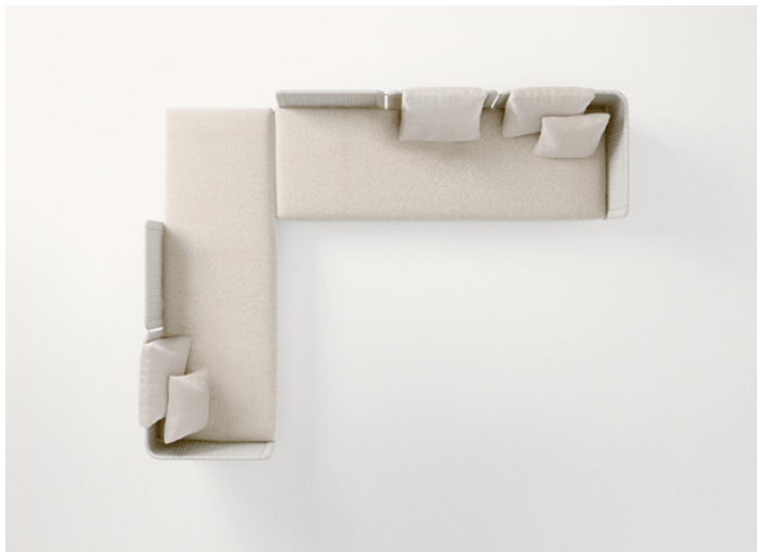
B39MS + B39ED