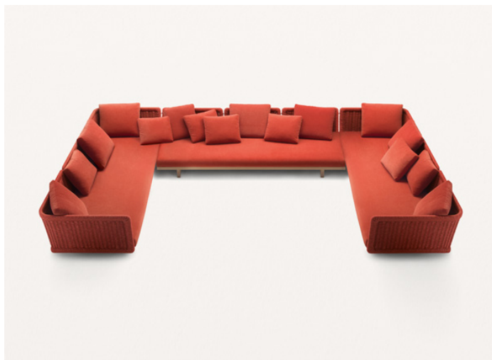
n° 2 B39B + B39F