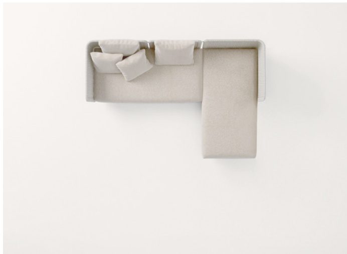
B39CS + B39NS