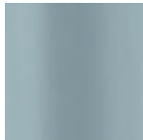
435 stainless steel (base)