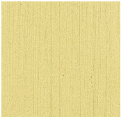
Ottone satinato Satin brass