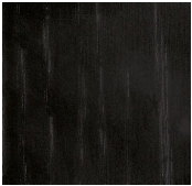
Nero poro aperto Black open pore